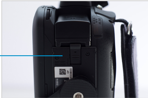
Bottom of back of camera