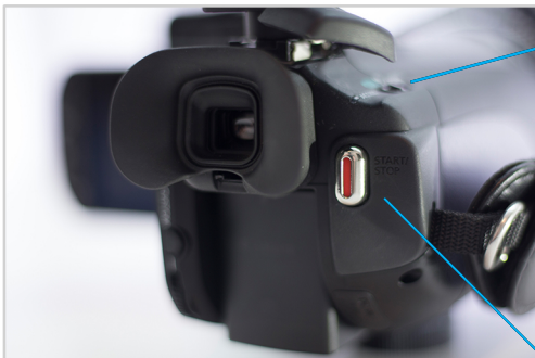
Back of camera